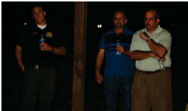
Who let these guys in? They're brining down the mood! Just kidding, we were glad to have some brave men at the cookout, too!