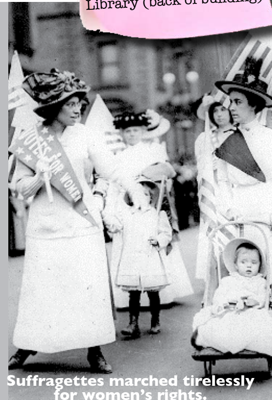
Suffragettes marched tirelessly for women's rights.

For more information on the rally go to: http://www.women.ky.gov/votesforwomen/